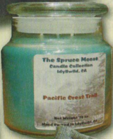
Locally made candles (scents include Pacific Crest Trail, Idyllwild Cabin & Garner Valley), $16.99 (The Spruce Moose)