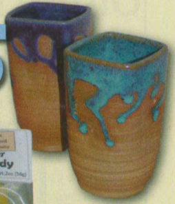
Hand-thrown ceramic tumbler (by Trudy Levy), $25 (Everitt's Minerals)