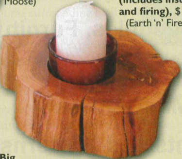
Wood candle holder (by M. Jones), $25 (Forest Furniture)