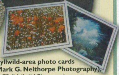
Idyllwild-area photo cards (Mark G. Nelthorpe Photography), $2.75 (Idyllwild Pharmacy)