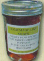
Prickly Pear Cactus Syrup (harvested locally), $9 (Idyllwild Nature Center)