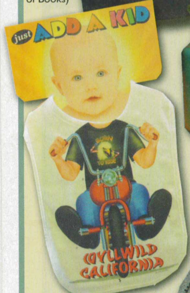
Baby biker bib , $9.99 (The Idyllwild Soda Pop & Sweet Shop)