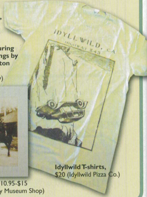
Idyllwild T-shirts , $20 (Idyllwild Pizza Co.)