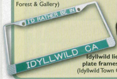
Idyllwild license plate frames , $15 (Idyllwild Town Crier)