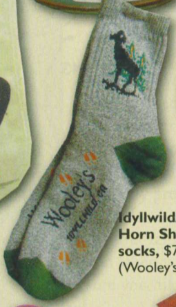
Idyllwild/Big Horn Sheep socks , $7.95 (Wooley's)