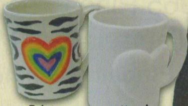
Paint your own pottery! (includes instruction, glazes and firing), $18 heart mug (Earth 'n' Fire)