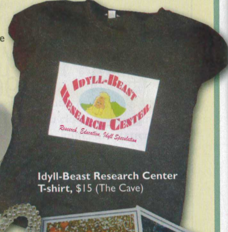
Idyllwild Research Center T-shirt , $15 (The Cave)