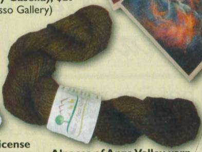
Alpacas of Anza Valley yarn , $10-20 (Magic Tree Toys)