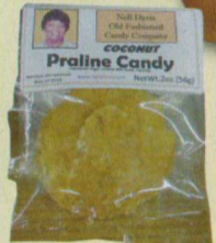
Nell Davis Old Fashioned Candy (made in Anza), $1.49+ (Fairway Market)