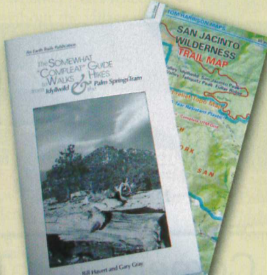
"The Somewhat 'Complete' Guide to Walks & Hikes from Idyllwild to the Palm Springs Tram," plus waterproof San Jacinto Wilderness Trail Map, $20.90 (Nomad Ventures)