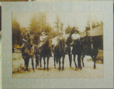
Historic photos (matted) , $10.95-$15 (Idyllwild Area Historical Society Museum Shop)