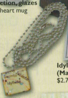
Idyllwild area map necklace , $14 (Prairie Dove Boutique)